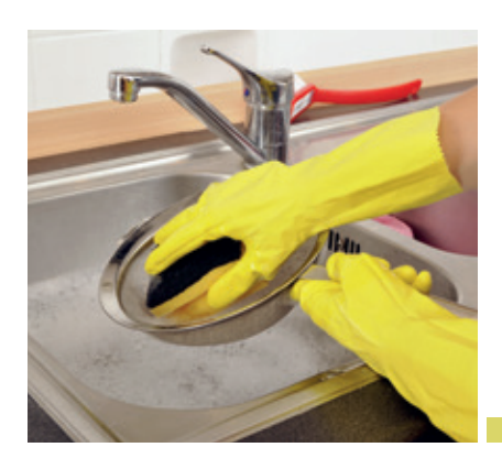
Direct contact with detergents or washing-up liquid can lead to skin problems.